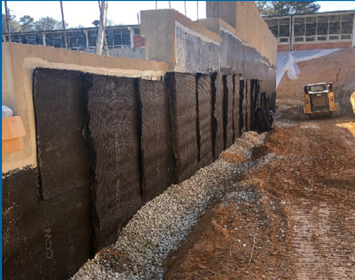
Gym Addition West Wall Backfill