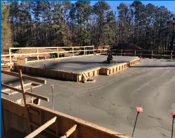
Gym Platform Concrete Pour