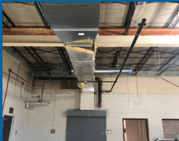
Cafeteria OH Rough