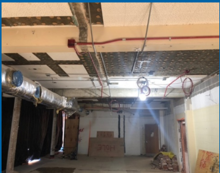
Admin OH Rough