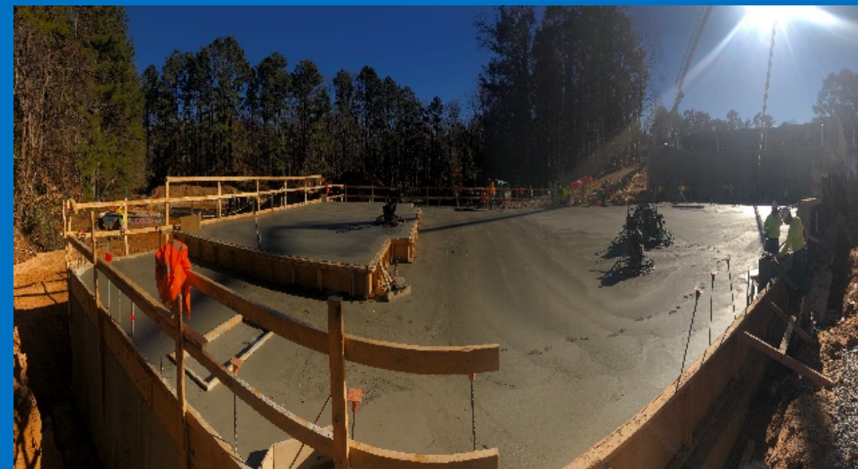
Slab on Grade Concrete Pour at Gym Addition