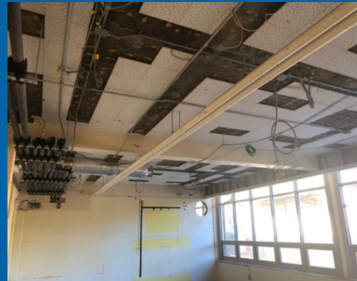
NE Wing OH Rough