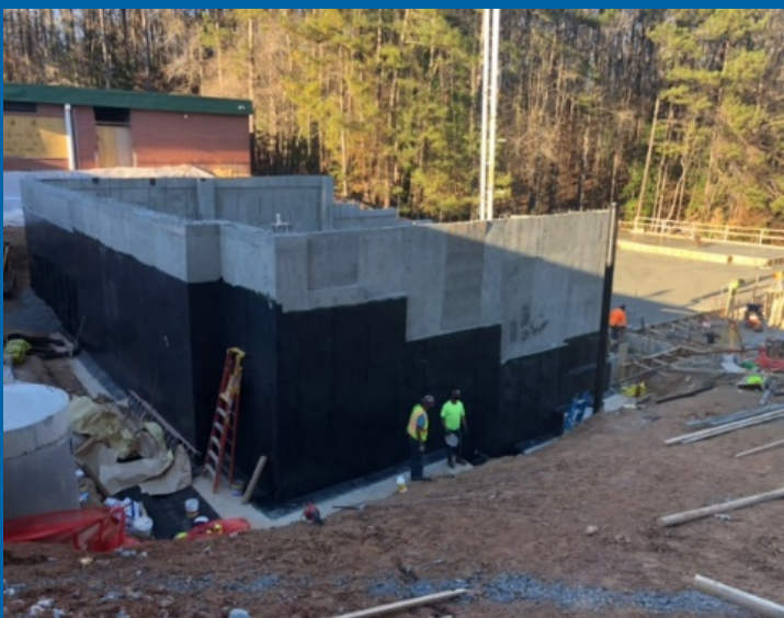
Continued Waterproofing at Foundation Wall